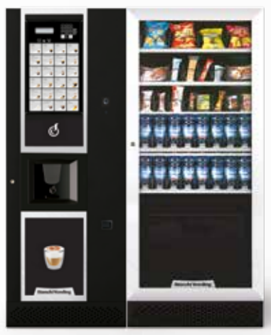
LEI400 SMART + ARIA M SLAVE

ARIA M, automatic spiral refrigerated 3° C vending machine for the sale of snacks, confectionary, sandwiches, yogurts and other fresh perishable foodstuffs, cans and bottles; available in master or slave version.